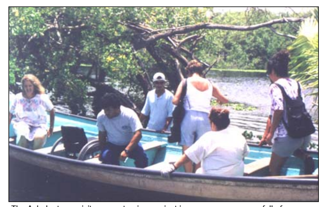
The Ashoka team visits an ecotourism project in a mangrove swamp full of crocodiles and many beautiful birds. No motorboats allowed!

We had the opportunity to visit two beautiful sites of ecotourism. One had a rustic restaurant serving gourmet seafood, overlooking a magnificent view of a mangrove bordered lagoon. The other site, also in a mangrove swamp, uses rowboats (no motorboats) to take groups of tourists through crocodile haunted waters to the nesting sites of egrets, jacanas, and spoonbills. The birds have learned they are safe from hunters, and tolerate the proximity of hyper-active nature watchers.