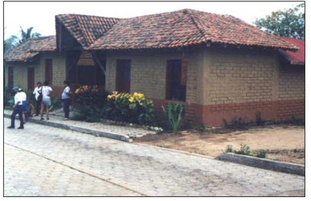
The cooperative organic cosmetic factory in Mazunte helps people who used to hunt sea turtles earn a livelihood.

A similar problem of cost has occurred at the Mazunte Cosmetic Factory. In this very attractive community cooperative, townspeople produce a range of organic creams, balms, and liniments from a variety of local and cultivated plants. The co-op is sponsored by The Body Shop, which helps distribute its products in their shops in the US and elsewhere. But local sales are low, even among tourists, because the prices are so much higher than equivalent products on the market.