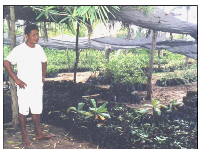
Nearly all the projects we visited on the Oaxaca coast had extensive nurseries of indigenous plants and trees for reforestation. This nursery is in an ecotourism reserve in a mangrove swamp.

stunning diversity, play a role in the balance of life. Different species pollinate a variety of plants which in turn might become extinct without them. Caterpillars of some Lepidopterans form an important part in the food chain of many birds and other animals. Only Lepidopterans! My god!