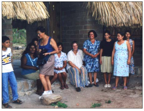
The Ashoka team visits with women at the Mazunte Cooperative Peanut Butter Factory. The thatch roof covers the arched ceilings of buildings made of strong, water-resistant compressed earth

In focusing on some of these possible contradictions and pitfalls, I do not wish to belittle the achievements of these programs, but to offer what I hope is constructive criticism. I record these observations in our newsletter in hopes they may serve others who are also working, along many different paths, toward more equitable, compassionate, and sustainable paradigms of development.