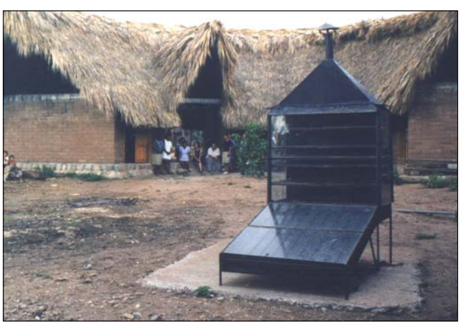
In front of the Mazunte Cooperative Peanut Butter Factory, a solar oven has been built to toast the peanuts.

Within the environmentalist movement there is awareness of the ecological costs of exporting food products to distant lands. Excessive use of fossil fuels is a big cause of global warming, and energy used to ship foods long distance adds to the problem. In the US the foods a typical family consumes have traveled an average of 2000 miles. For this reason, there is an international movement to consume more local produce and avoid imported foods. Promoting distant marketing of organic