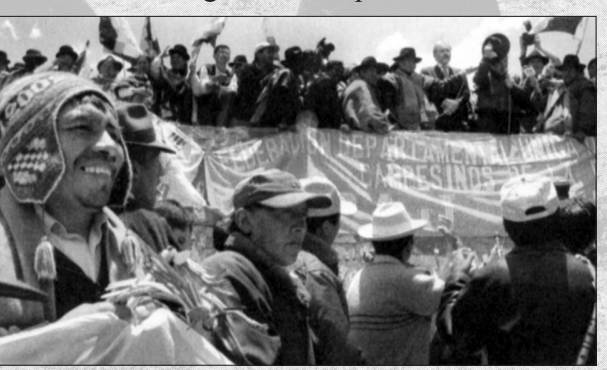
Thousands of marginalized workers protested in the streets of La Paz to demand the overthrow of president Gonzalo Sanchez.

What triggered the protest? The issue that sparked the massive protest was export of natural gas. But behind the gas lay a smoldering history of grievances related to an economic system—national and global—that increasingly favors the rich and marginalizes the poor.