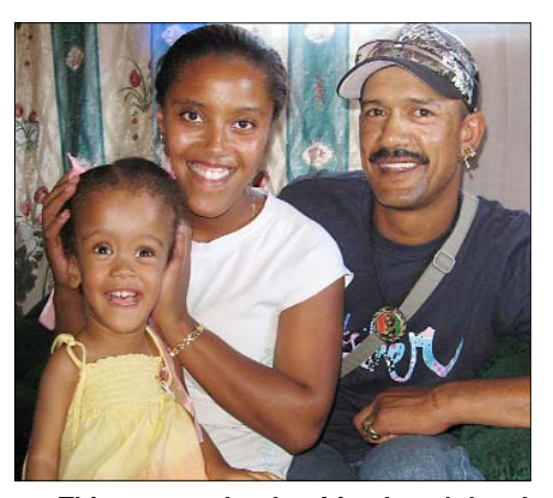
This woman, her boyfriend, and daughter with hydrocephalus, live in a squatter settlement on the outskirts of Cape Town.

The housing situation is a glaring example of the less than optimal implementation of the ideals of the new constitution. In the vast periurban squatter settlements or "townships," and in the former "homelands" in rural areas, millions of families live in tiny makeshift shacks made of cardboard, tarpaper, and/or scraps of wood. Little by little, the government's low cost housing project has undertaken to replace these shacks with small cement block huts. However, progress is slow, and the waiting lists are long. There is no functional provision for giving priority to those in greatest need. On the contrary, families with disabled or chronically ill members too often end up at the tail end of the list—which can mean waiting 4 to 5 years or longer. Bribes and corruption lead to a situation where those with lesser needs often get served before those whose needs are greatest.