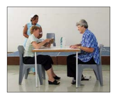
#2. The blind woman points to her eyes, and asks the waitress for the food list in Braille. The waitress, not understanding, says "Bralen?"—which in Afrikaans means "spectacles" or "glasses." (Laughter).