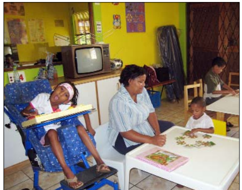
Some of the APD centers provide a wide range of services including early stimulation and special education.

much as possible. In reality, schooling possibilities and services for disabled children are few and far between, especially in rural areas. For this reason, the Association for Persons with Disabilities (APD), as a large, non-government organization, makes an effort to have as farreaching an area of coverage as it can. However, despite the APD's many branches, and the scores of towns and villages that are reached, the APD is the first to admit that there are many disabled people who are not reached.