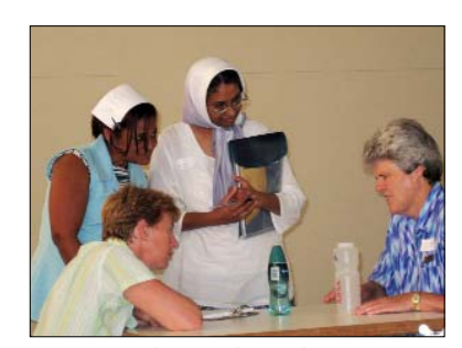
#4. The discussion with the manager starts out with frustration and misunderstanding on both sides. But then an understanding is reached. The blind woman agrees to translate the menu into Braille. The manager agrees to make the Braille menu available to clients on request.