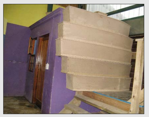
Low cost wooden coffins and crosses help poor families spend less on deaths from AIDS.