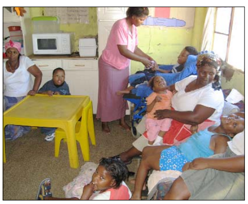
In some of these home-based day-care centers, several mothers help take care of the group of children.

Most of the "care providers" at the small neighborhood daycare centers were local mothers of disabled children who provided services in their homes. Mothers of other disabled children would drop off their children on their way to work, and pick them up again on their way home. Or, in some cases, the APD would provide a van and driver to transport the children to and from the center.