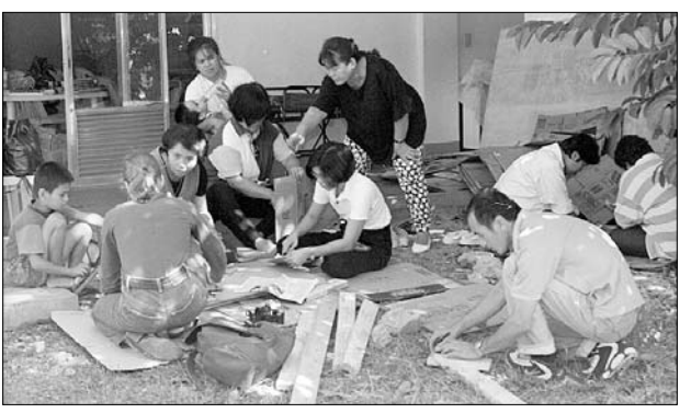
Mediators, with the help of a child, learn to make assistive devices

The second day, the mediators met in small groups with disabled children and their parents. The purpose was to listen to the parents and children about what they considered to be their aspirations and concerns. Rather than focus on the biomedical needs of the children (which is what happens too often in conventional rehabilitation), they were encouraged to take a more holistic approach, exploring the full needs of the child, ranging from food and housing, to play and interaction with other children, to schooling, skills training, work, and full participation in society. Some parents wept as they described the difficulties they encountered. But at the close of the sessions, they expressed thanks for the opportunity to be listened to so attentively...and by a group of educated persons and professionals!