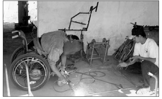
Polo teaches a non-disabled youth to make wheelchairs.

The 3 disabled instructors have ideas of their own. All are from humble origins, but they have spent time living in cities and exchanging ideas with disabled activists in Mexico and the USA. They have thus garnered new insights and a strong sense of their rights.