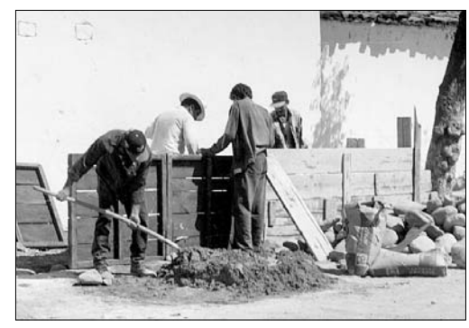
Villagers construct the wheelchair ramp in Aiova.

With rocks, sand, and cement, the villagers built the ramp against the back wall of a big adobe house by the bus stop. First they built a temporary retaining wall of wood. This they lined with rocks which they cemented together. They filled the enclosed space with rocks and sand, and capped it over with cement.