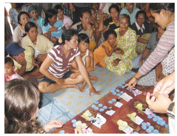
The people became very involved in the graphic "community diagnosis" in which they identified, prioritized, and explored possible solutions to their biggest health-related problems. Here they stretch string between the different problems to show which ones are often linked to or lead to others.

To this end the ASRI team invited me to take part in "focus group" discussions in three neighboring villages. In preparation for these meetings the team discussed possible methods to get the villagers to participate fully and to speak out about their biggest health-related concerns. I suggested two techniques that might be useful: (1) a "community diagnosis," and (2) the "chain of causes" technique. Before setting out on our visits to the neighboring communities we spent some time learning how to use these techniques.