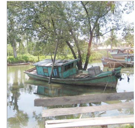
Much of the travel in Kalimantan is done by river on boats.