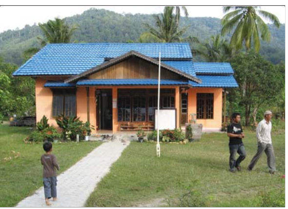
The ASRI Klinik with the rainforests of Ganung Palung National Park behind

There are no easy answers to the ecological dead end that has emerged in West Kalimantan and similar places in Indonesia. Indonesia is the world's 4th most populated nation, after China, India, and the USAalthough it ranks 22nd in terms of its economy. The island of Java alone has a population of 100 million people—a third that of the United States—in an area the size of the state of New Jersey. The capital city, Jakarta, now has over 20 million people, and keeps growing—as does massive joblessness and destitution. The government's urgency to export its surplus of indigent people to the less populated isles is understandable—even if in the long run it is counter-productive.