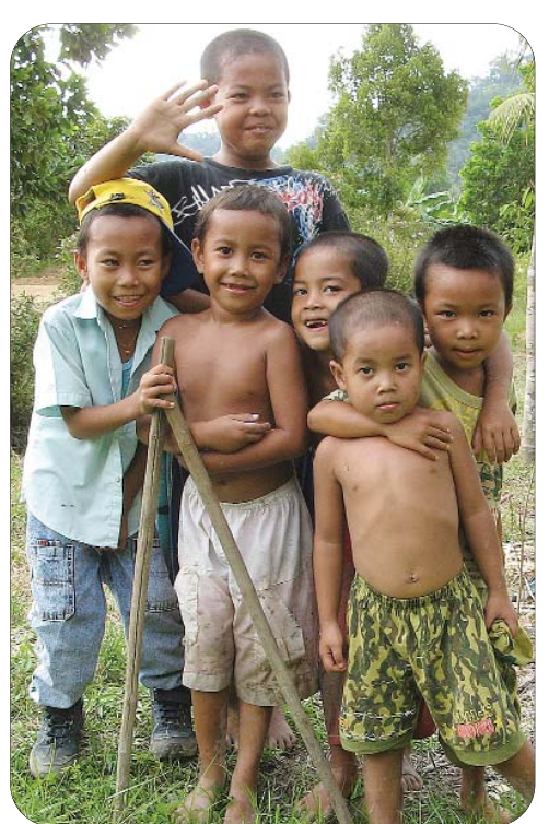
Children of Kalimantan. Borneo, the third largest island in the world, is divided between Indonesia, Malaysia and Brunei, an independent nation. Indonesia's region of Borneo is called "Kalimantan," although Indonesians use the term for the whole island.

late 20s, I visited the remote reaches of Mexico to study the birds and plants of the Sierra Madre Occidental . Four decades