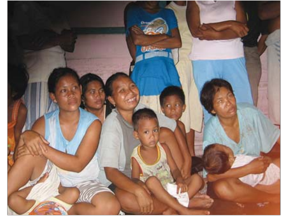
The people of West Kalimantan are poor but—at least in the villages near the ASRI Klinik, very friendly.

As I came to know the people better, I was impressed by the easy-going relationship between men and women, old people and young people, and especially between adults and children. Although in the villages near the ASRI Klinik the majority of the people are Moslem, there was no indication that harsh restrictions were imposed on women's social liberties or dress. In the village meetings women outnumbered men, and often took the lead in the discussions. Also, mothers were completely at ease with breastfeeding their babies in public. One staff member I talked to at the ASRI Klinik referred to the type of Muslim religion practiced in this part of Indonesia as "peaceful Islam."