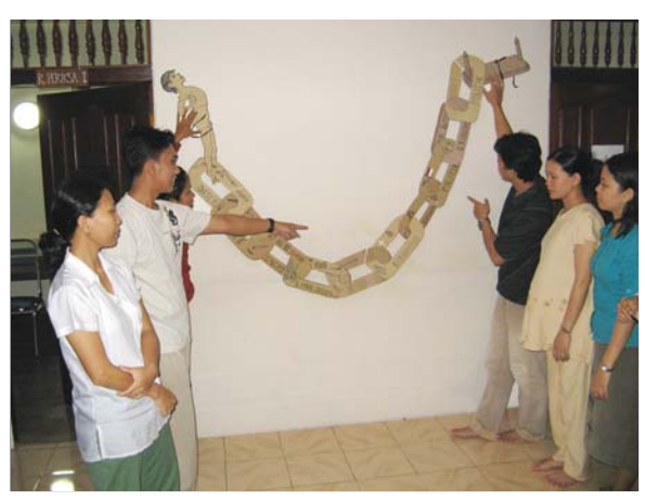
pictures symbolic figures are the Story of Luis from Helping Health Workers Learn.

The second technique we decided to use in the village meetings focused on identifying the chain of causes behind the various health problems of the community. For