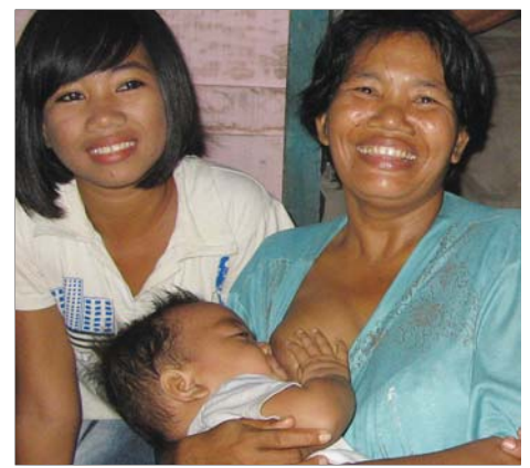
In Kalimantan many mothers go directly from breastfeeding their babies ...

sent different categories of causes: physical (things), biological (worms and germs, etc.), cultural (beliefs and customs), economic (money) and political (who has power over whom). To these five categories of causes we now add the increasingly important group of causes, namely environmental. After building the chain, the group discusses which links could perhaps be broken—by individual persons or families, or by a community working together—in order to prevent other children also from dying of tetanus.