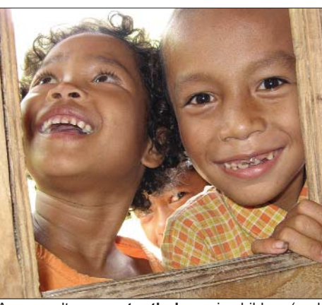
As a result, severe tooth decay in children (and adults) is almost universal.

The use of the "But why?" technique in relation to the story of Eco was especially productive. When the group of villagers began to analyze which links of the chain they might break to prevent similar poverty-related deaths, they reflected on the high costs of medical care and how it increased their poverty. In turn, they saw how the shortage of money to pay for costly health services contributes to increased illness and death, since often they don't get urgently needed care in time. People realized more clearly how the "Payment for Work" plan of the ASRI Klinik could help break the vicious cycle between health expenditures and poverty.