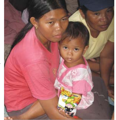
to weaning them on junk foods loaded with sugar

In revising the story, the staff wanted to give emphasis to the environmental causes of poor health, and help the villages discover how the destruction of the rainforests can contribute to poverty, sickness and death. So in their story, as a link in the Chain of Causes, they included the increasingly common crop damage caused by plagues of grasshoppers. In recent years, as the logging and wildfires have reduced forestland and replaced it with vast areas of monoculture alang-alang grass, huge clouds of grasshoppers have begun to swarm into the rice fields and