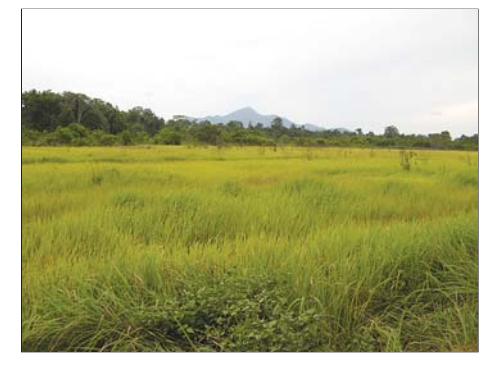
Vast areas of rainforest have been replaced by alang-alang, an introduced foreign grass that, once it takes over, forms a monoculture where nothing else can grow.

taken over. Once this imported grass takes hold, no other plants can successfully grow there. Every dry season the grass catches fire and burns up the tree seedlings that are trying to repopulate the devastated land. The next rainy season the grass grows back again and the pervasive monoculture continues.