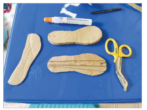
The shoe inserts, made by gluing together laminated strips of cardboard, were wedge shaped with the thicker part on the outside, to tilt his ankles inward

In the 5 months since the ASRI Klinik was opened, an astounding amount has already been accomplished. Most importantly, the program has the enthusiastic support of the