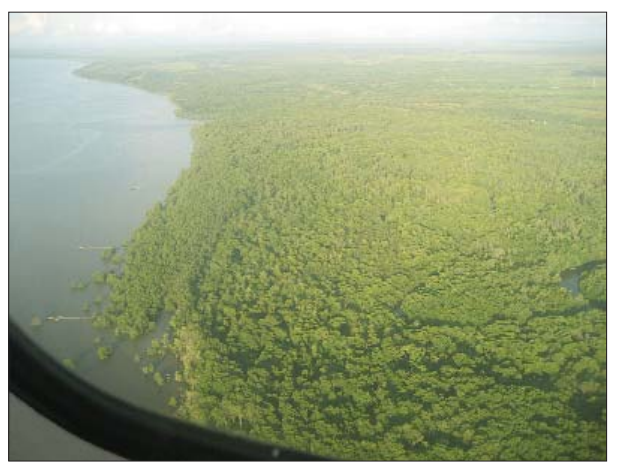
West Kalimantan rainforests as seen from the air

But there may be other reasons as well. A number of comparative studies have shown that children who are brought up in a child-friendly, non-repressive way, where there is a lot of touch, bodily acceptance, and personal warmth, tend to grow up to be gentler, more humane, and less aggressive adults. Likewise, societies that have more permissive, child-friendly, curiosity-accepting customs of raising children, tend to be more peaceful and harmonious, and less belligerent.