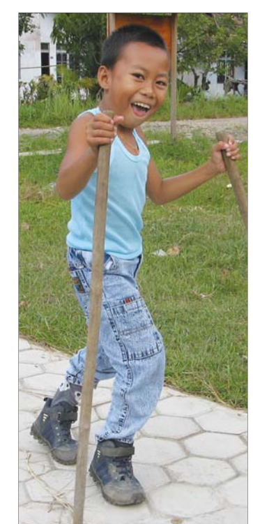
With shoe inserts