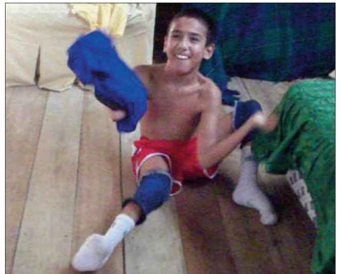
Although it took a big effort, he is proud of mastering his new skill.