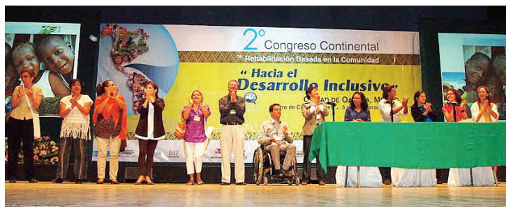
Of the 16 countries that participated in the Continental Congress on CBR, Colombia had by far the largest number of programs represented. In the closing ceremony the contingent from Colombia gave a rousing salute on stage.

For all its organizational foibles, I found the Oaxaca Congress exhilarating. Who knows?—Perhaps humanity has a small chance of surviving after all!