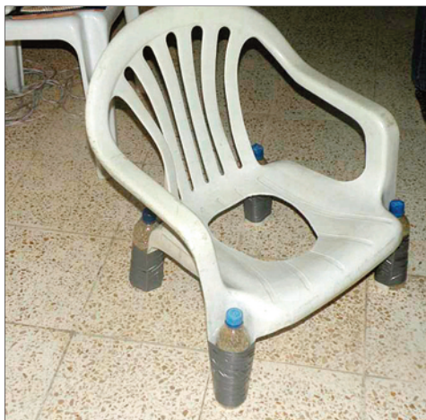
They put the sawed-off legs of the improvised commode in sand-filled bottles so the added weight would give stability.