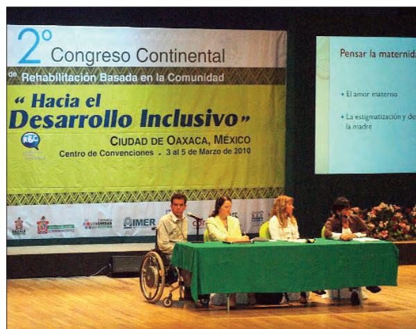
In the 2nd Continental Congress on CBR it was good to see how far CBR has moved toward being open-ended and inclusive.

From “training” to empowerment. The original theoretical design of CBR, back in the 1980s, was for the most part top down. Governments, rehab professionals, non-governmental organizations (NGOs), community leaders, volunteer “local coordinators” and marginalized