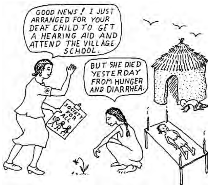
In the early years of CBR, the focus was primarily on alleviating the child’s disability, with too little attention on the basic poverty-related needs of the child and family. Today, CBR—with its increasing focus on “Inclusive Development”—tries to help the whole family and community live in more empowering, less disabling circumstances. While in practice there is still a long way to go, this new conceptual framework is encouraging.

Greater cooperation between government and non-government initiatives is, at least in theory, a big step forward. However, in nations or communities where the government has strong ties to an elite minority committed to policies that widen the gap between rich and poor, problems tend to emerge. In most countries, at least in Latin America, governments have dragged their heels in launching CBR programs. Of the few programs spearheaded by governments, most have petered out. With few exceptions, the most vibrant and successful CBR programs have been initiated by NGOs, religious orders, and (more recently) by organizations of disabled persons themselves.