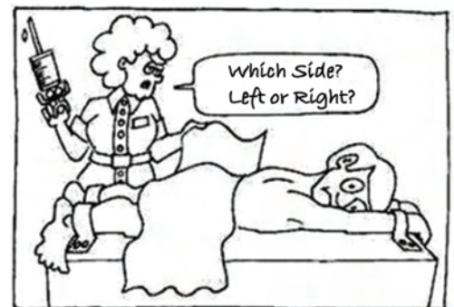
When CBR was first promoted, it was fairly rigidly defined by professionals. Local communities had little “freedom of choice” to change or adapt the prescribed model. Now things are changing: from top-down to bottom-up. People with disabilities are increasingly becoming leaders, or subjects, of the CBR process, rather than meekly remaining recipients, or objects. (Cartoon from a talk, at the Congress, on “Sustainability,” by Olmedo Zambrano.)